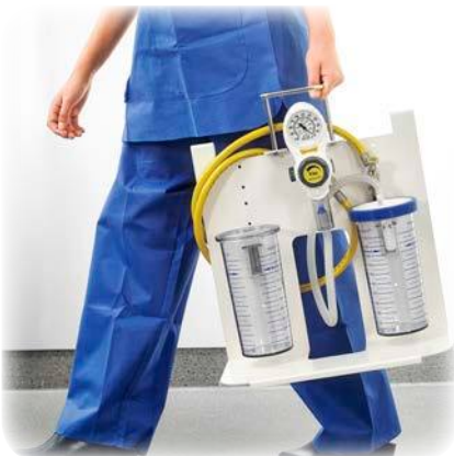
Suction with CGS

For more information on the entire "ATMOS Medical Suction Systems" product range, visit: