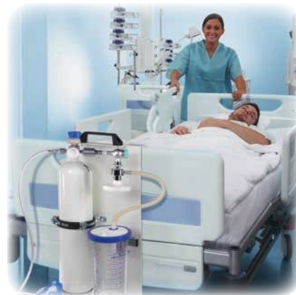
Mobile Oxygen Supply