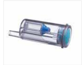
Mechanical overflow protection

Strong on details: with suitable and carefully selected accessories ATMOS supports the application-tailored use of the new S AIR tapping unit for compressed air in clinics and specialist practices. For suitable connection tubes for compressed air with NIST connection and all current tapping connectors, see the brochure "Connection tubes and gas probes".