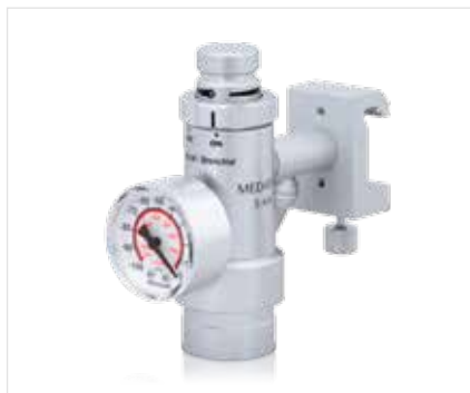
Equipment rail 25-35 x 10 mm with NIST connection