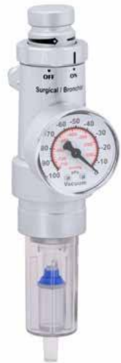
Mechanical overflow protection with special particle filter

Hydrophobic bacterial and viral filter: it also offers the greatest of safety in the event of foam formation. In this way, the hydrophobic bacterial and viral filter protects the tapping unit and the central compressed air system of a clinic or special practice in a particularly reliable way. The hydrophobic bacterial and viral filter is attached to the S AIR tapping unit with a stable, precisely fitting adapter with bayonet coupling.