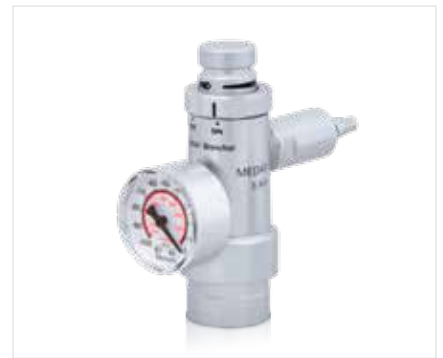
Wall connection for BOC (BS 5682) Great Britain