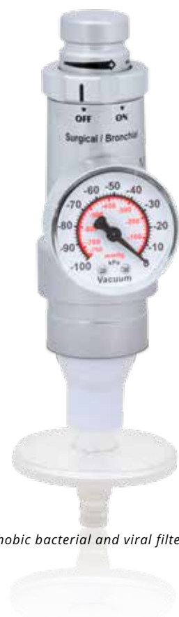
Hydrophobic bacterial and viral filter