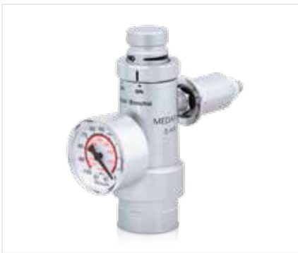
Wall connection for MEDAP