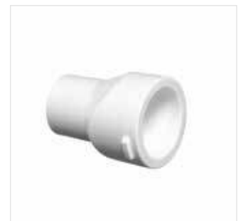
Adapter for hydrophobic bacterial and viral filter