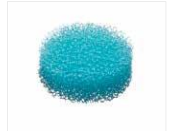
Particle filter for mechanical overflow protection