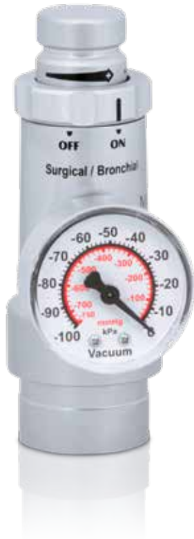
S AIR B 800

High flow rate: whenever large quantities of secretions, blood and any other liquids are to be removed in continuous operation, the new S AIR B 800 is the ideal partner for bronchial and surgical aspiration. Thanks to the high flow rate of 36 l/min, the stress on the patient is reduced considerably, in the OR, in intensive care and in special practices.