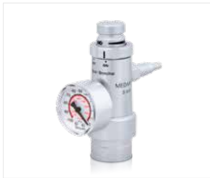
Wall connection for AGA (SS 87 524 30) Sweden