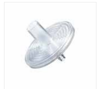
Hydrophobic bacterial and viral filter