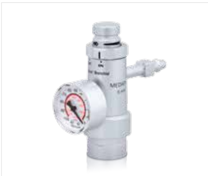
Wall connection for DIN