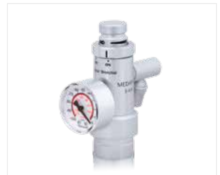
Screw connection for mounting to surgical trolleys and carrier frames