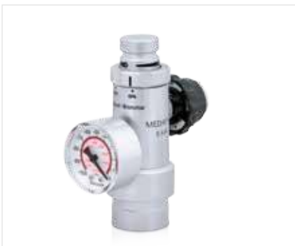
Wall connection for Air Liquide (NF S 90-116) France