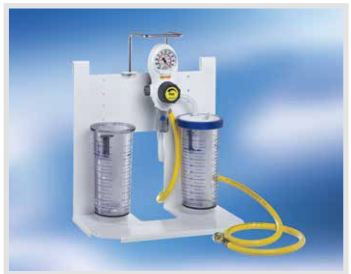
S VAC: portable aspiration unit, complete unit