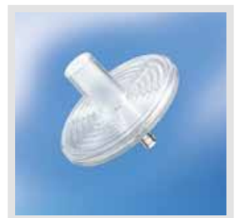
Hydrophobic bacterial and viral filter