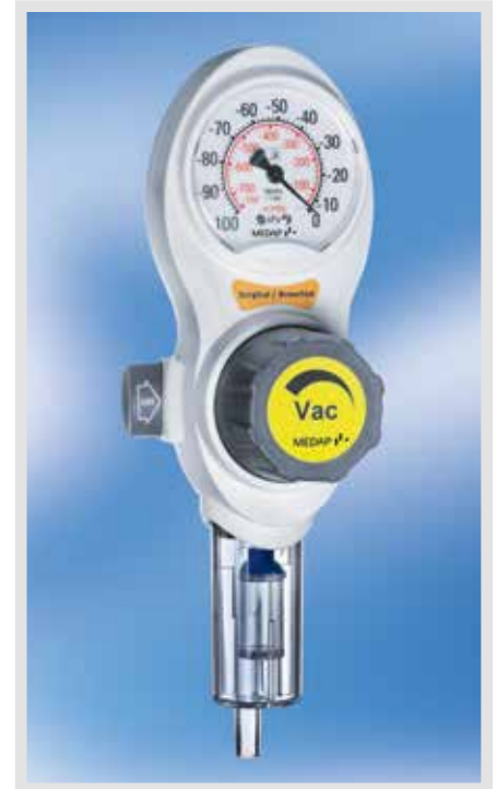
Mechanical overflow protection with special particle filter

Hydrophobic bacterial and viral filter: it also offers the greatest of safety in the event of foam formation. In this way, the hydrophobic bacterial and viral filter protects the tapping unit and the central vacuum system of a clinic or specialist practice in a particularly reliable way. The hydrophobic bacterial and viral filter is attached to the S VAC tapping unit with a stable, precisely fitting adapter with bayonet coupling.