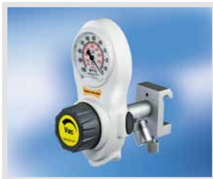
Equipment rail 25-35 x 10 mm with NIST connection