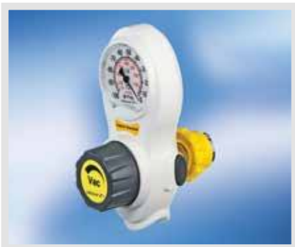
Wall connection for Air Liquide (NF S 90-116) France