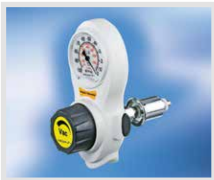
Wall connection for MEDAP