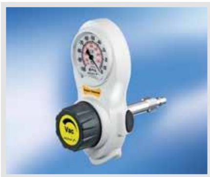
Wall connection for DIN

International use: with a wide range of different connection forms, the S VAC B 900 and S VAC D 200 are ideally suited for flexible installation in clinics and specialist practices.