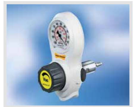
Wall connection for BOC (BS 5682) Great Britain