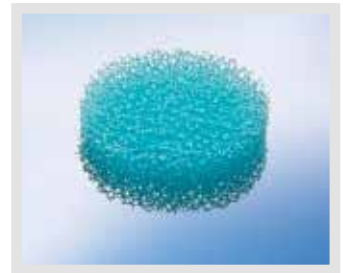
Particle filter for mechanical overflow protection