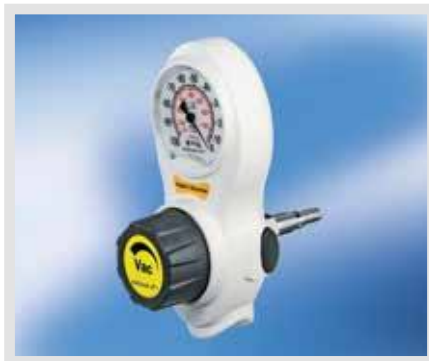
Wall connection for AGA (SS 87 524 30) Sweden