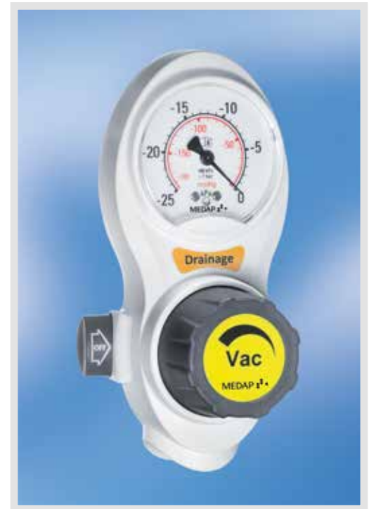
S VAC D 200: in ISO colour coding