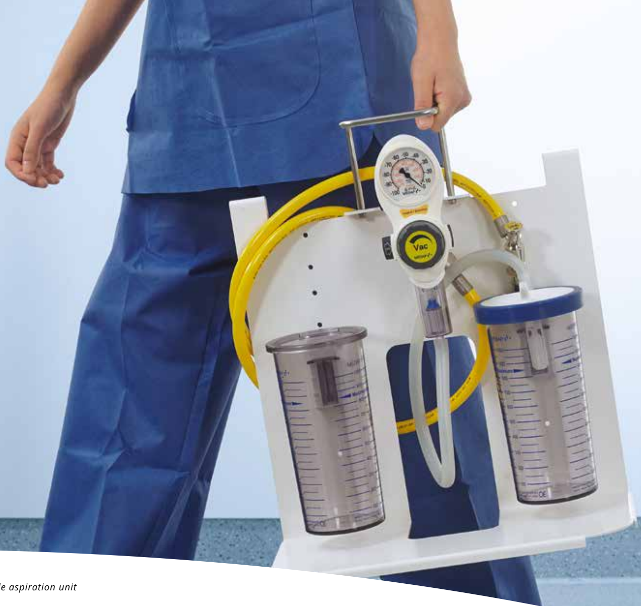
S VAC: portable aspiration unit

Easily portable septic fluid aspirator: in combination with a lightweight, powder-coated aluminium carrier frame and the new S VAC B 900 you achieve a practical, easily portable aspiration unit for power-independent use in intensive care. With the corresponding application sets (AS) the S VAC portable aspiration unit becomes a high-performance septic fluid aspirator.