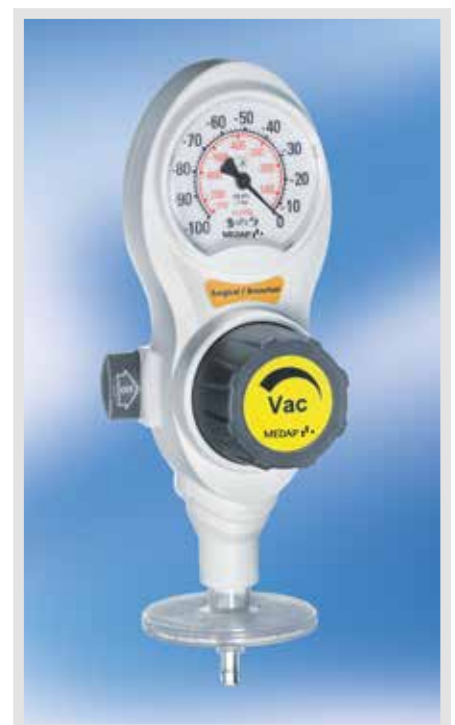
Hydrophobic bacterial and viral filter