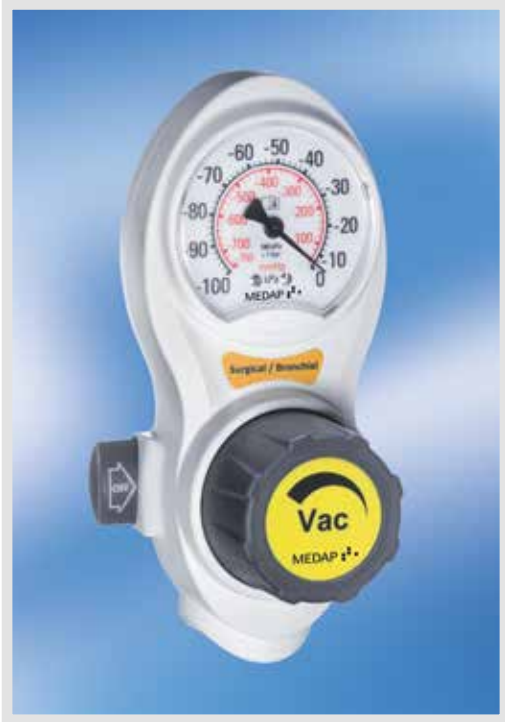
S VAC B 900: in ISO colour coding

Fast and extremely high flow rate: whenever large quantities of secretions, blood and any other liquids are to be removed in continuous operation, the new S VAC B 900 is the ideal partner for bronchial and surgical aspiration. Thanks to the extremely high and fast flow rate of 100 l/min, the stress on the patient is reduced considerably, in the OR, in intensive care and in special practices.