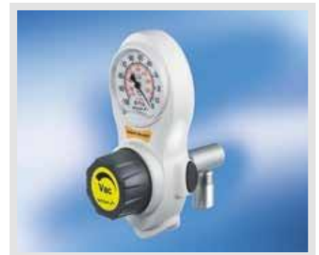
Screw connection for mounting to surgical trolleys and carrier frames