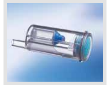
Mechanical overflow protection

Strong on details: with suitable and carefully selected accessories ATMOS supports the application-tailored use of the new S VAC tapping unit for vacuum in clinics and specialist practices. For suitable connection tubes for vacuum with NIST connection and all current tapping connectors, see the brochure "Connection tubes and tapping connectors".